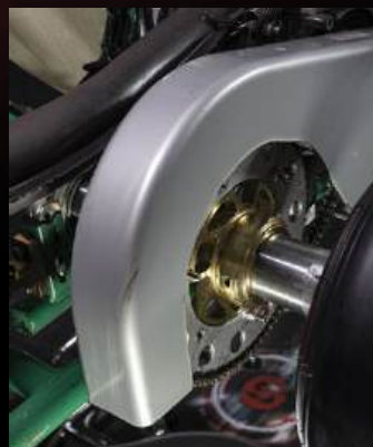
CHAINS & GUARDS